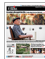
Archived Print Issues