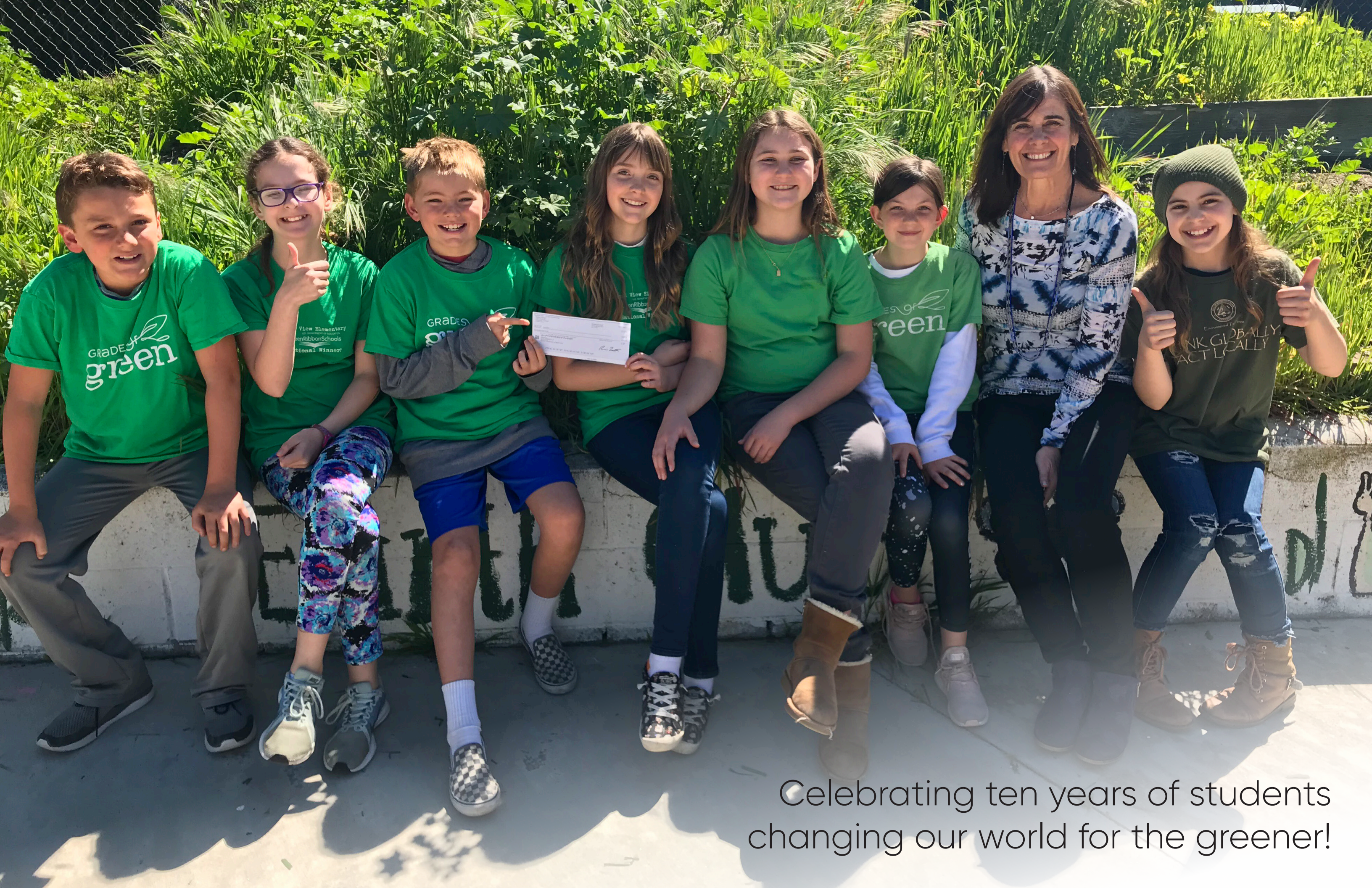
Celebrating ten years of students changing our world for the greener!